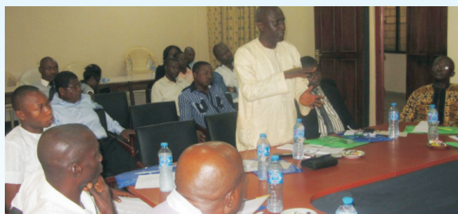
Question and Answer Session with Participants