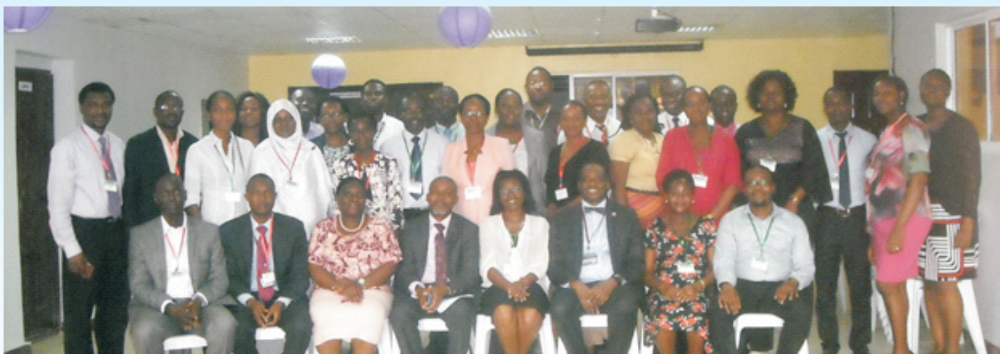
Group photograph of participants and facilitators

Cochrane Nigeria recently headed down to Idi-Araba, Surulere, Lagos to hold a two-day workshop on Evidence based-Medicine and Systemic reviews at the Lagos University Teaching Hospital. The workshop took place from 29-30 March 2016 at the Surgery Training Centre LUTH and was a joint collaboration between the LUTH and Cochrane Nigeria. Thirty-one participants, from the College of Medicine University of Lagos, Igbinedion University and Babcock University attended the workshop. Most of the participants, however, were from the College of Medicine, University of Lagos.