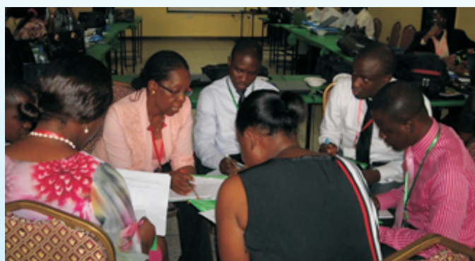
Interactive small group sessions