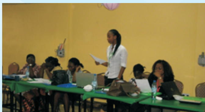
Presentation of group work by a participant