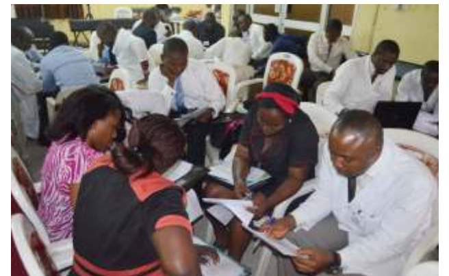
Participants during group work session